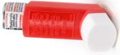
ProAir HFA Albuterol Sulfate