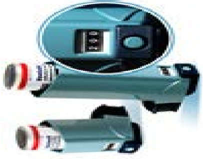
Ventolin HFA Albuterol Sulfate