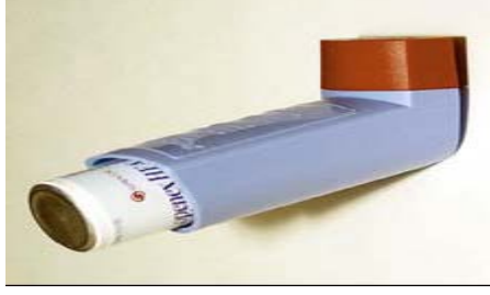
Xopenex HFA Levalbuterol Tartrate