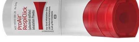
ProAir RespiClick Albuterol Sulfate

Many asthma inhalers look similar, especially in color. Most asthma patients are prescribed two medications: (1) a long-acting medication, also referred to as a “Maintenance” medication and (2) a short-acting medication, also referred to as a “Rescue” medication.