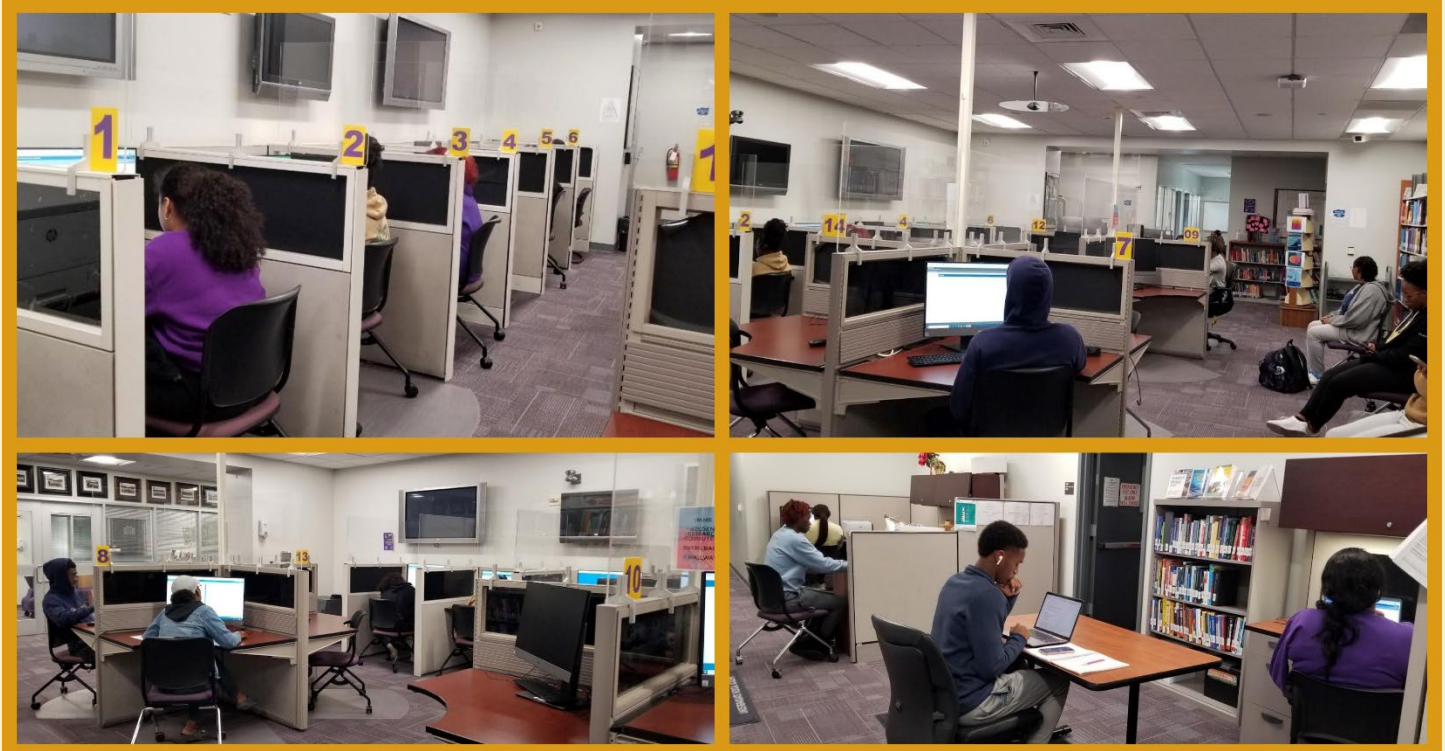
UMA Scholars taking the practice MCAT/DAT exam