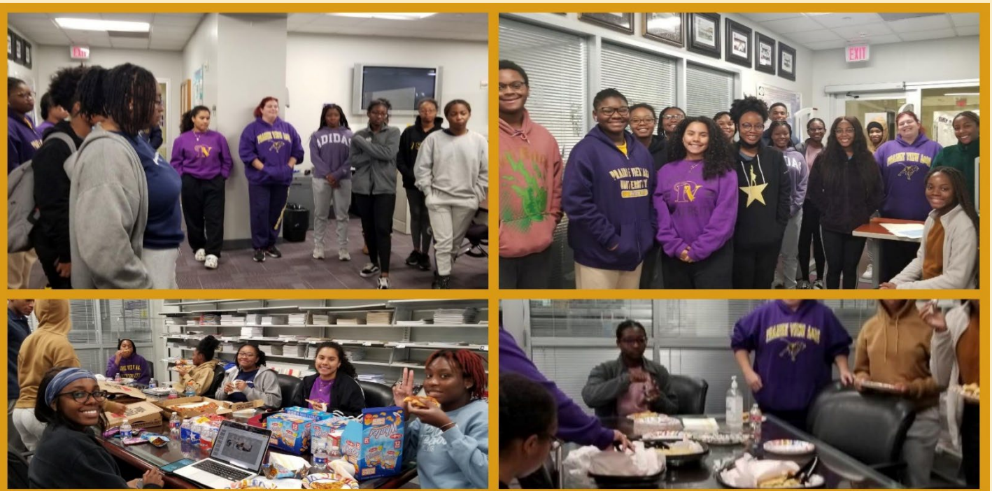
UMA Scholars taking the practice MCAT/DAT exam