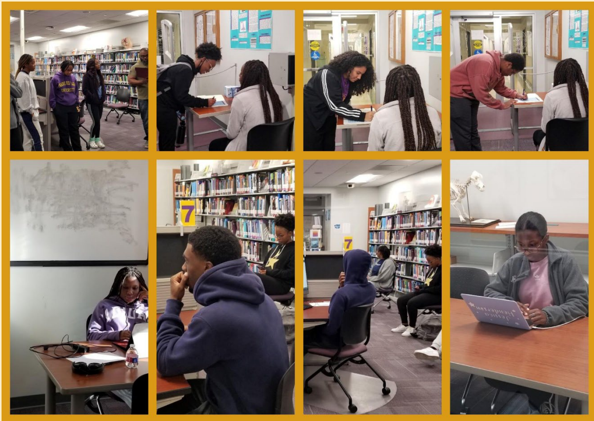
UMA Scholars taking the practice MCAT/DAT exam