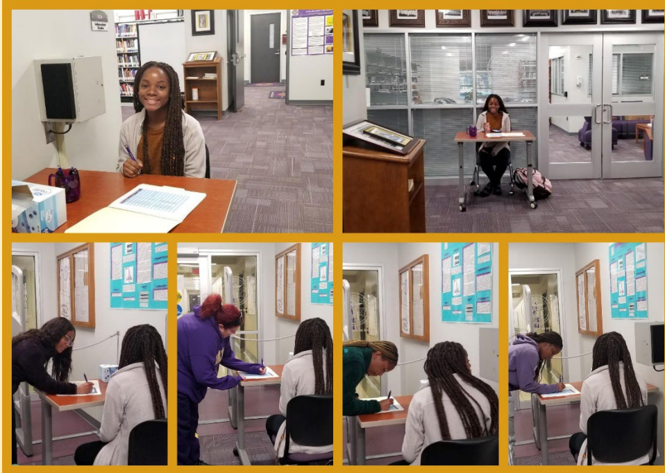
UMA Scholars taking the practice MCAT/DAT exam